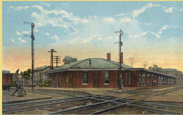
Post card image of Orrville Union Depot in 1922.

ORHS is proud to be a participant in Operation Lifesaver!